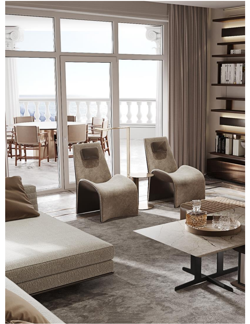
Raffles Residences The Palm Dubai