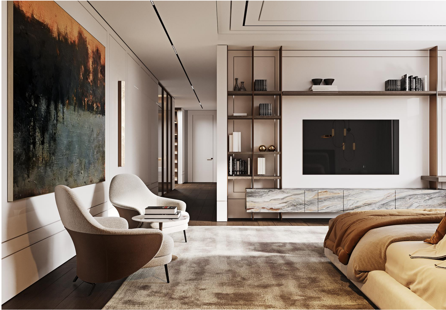
Sales Offer – Unit R8